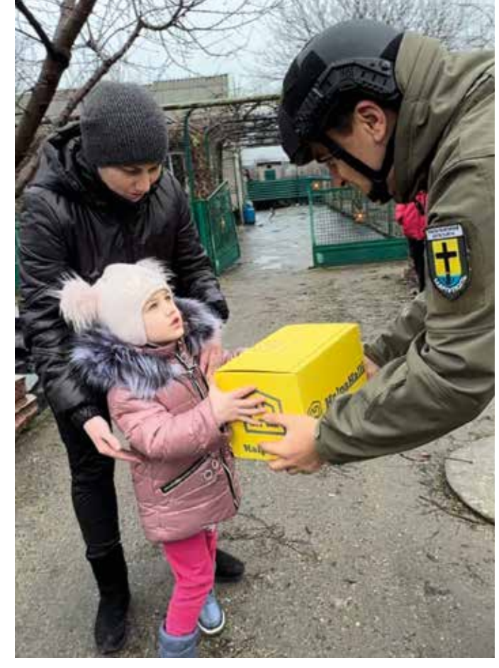
Gift boxes were also distributed to families with children, in the surrounding villages near the city of Kherson. The yellow boxes were received with thankfulness. Loud grad-rocket explosions were heard all the while a short distance away.