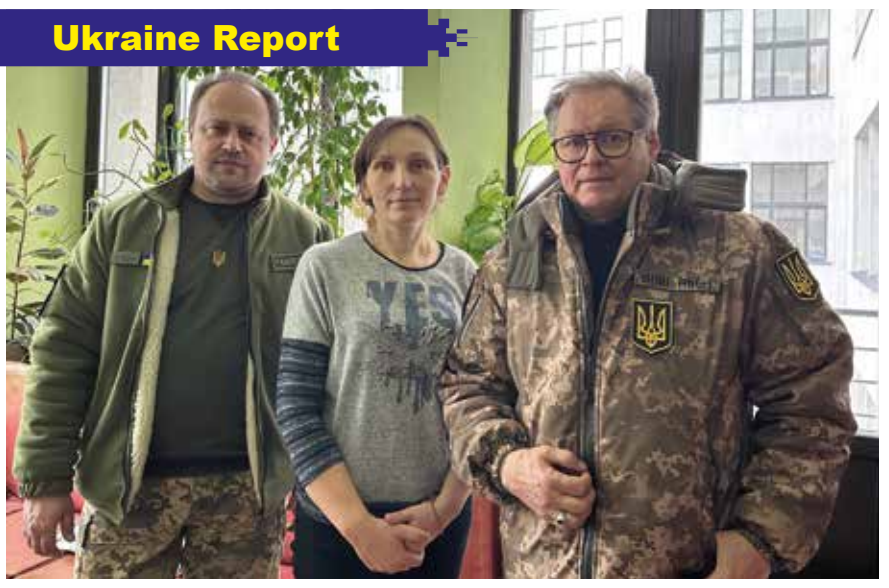
The vice chair of the military administration of the Kharkiv region thanked GCMM upon receiving 230 wood-burning stoves. Russia continues to shell Kharkiv and its surrounding areas daily.