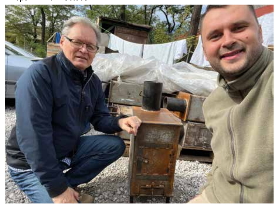
Below: This is the very first stove built for the initial 25-stove order from Zaporizhzhia in October.