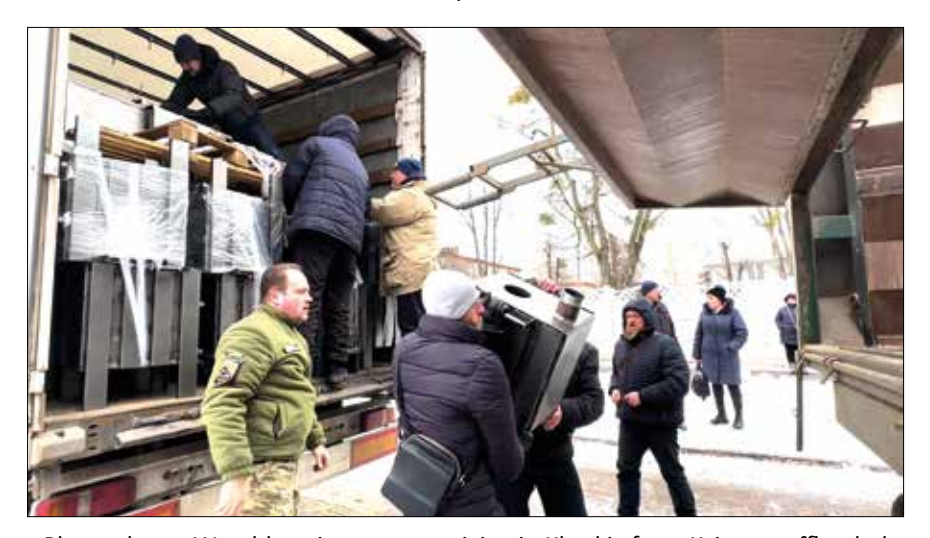
Photo above: Wood-burning stoves arriving in Kharkiv from Kyiv, are offloaded to other trucks for delivery. The stoves are also picked up from this loading dock with domestic vehicles.