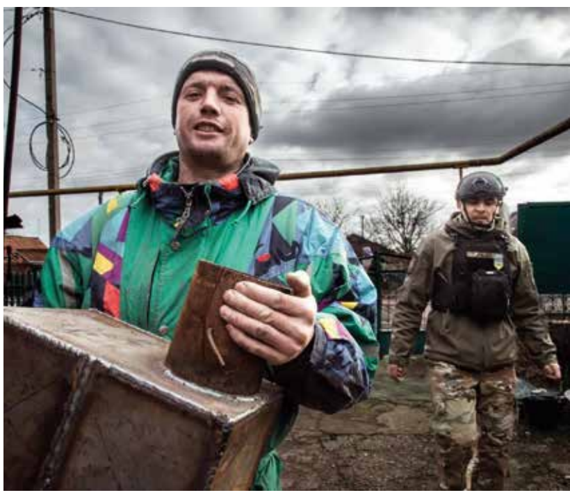
Wood-burning stoves have been distributed to thousands of homes in the hardest hit zones. A single house may shelter anywhere from 2 to 100 people.

Below: Sharing borscht soup, in an underground bunker near the line of fire.