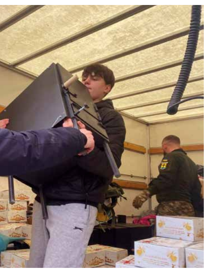
kshop in Ternopil, in western Ukraine, were produced using