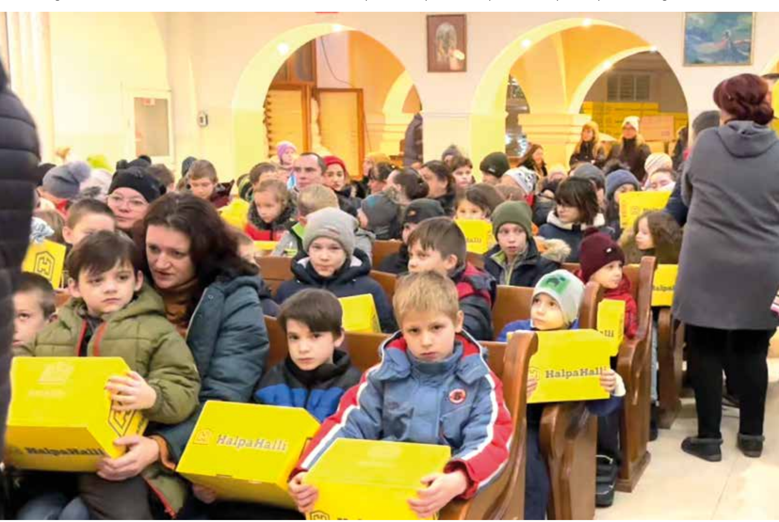
The children of the Kherson Evangelical Baptist Church received gifts at the Christmas celebration that was arranged for the children.