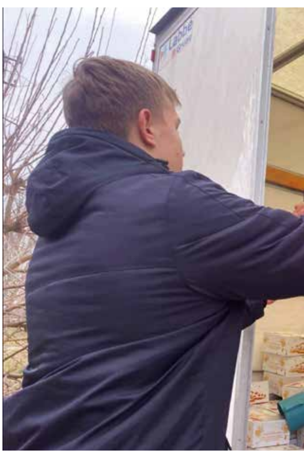
Photo above: Wood-burning stoves from the metal wor more refined materials and finishing touches.