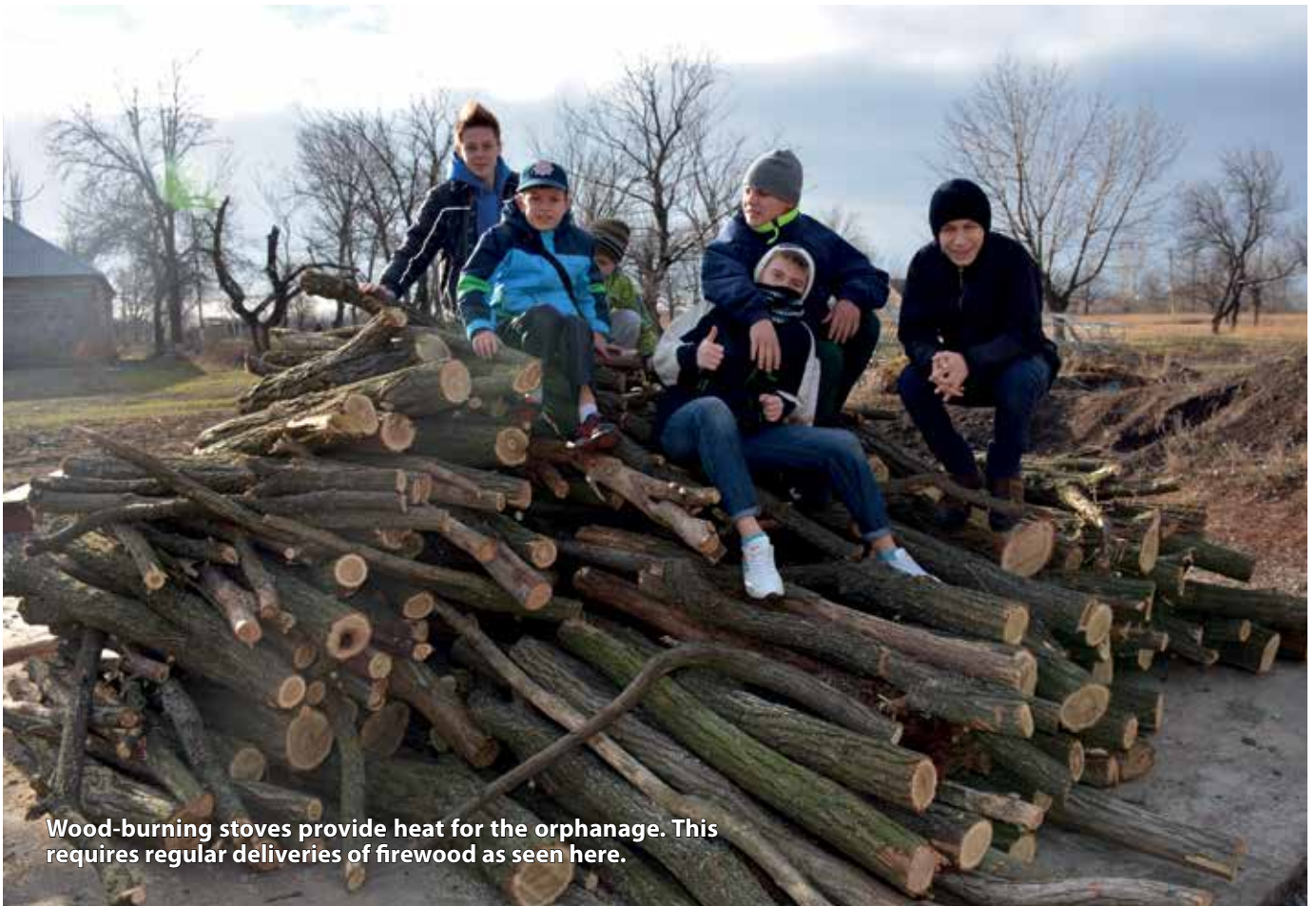
Wood-burning stoves provide heat for the orphanage. This requires regular deliveries of firewood as seen here.