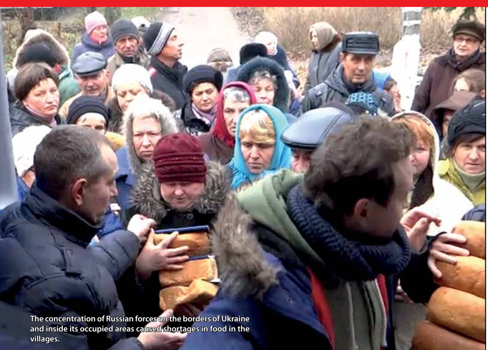
The concentration of Russian forces on the borders of Ukraine and inside its occupied areas caused shortages in food in the villages.

Some people have been able to evacuate sensing that something terrible is about to happen.