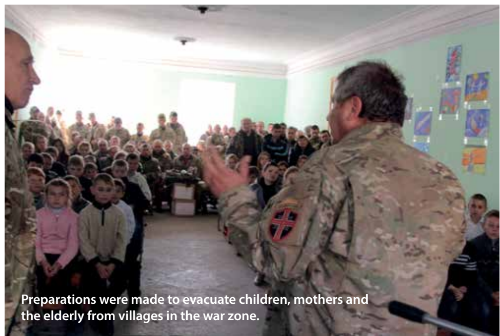
Preparations were made to evacuate children, mothers and the elderly from villages in the war zone.

Life goes on. They continue to minister under difficult circumstances. For strategic reasons power is cut every night and communication is down. The threat of major military action creates a lot of problems for these churches.