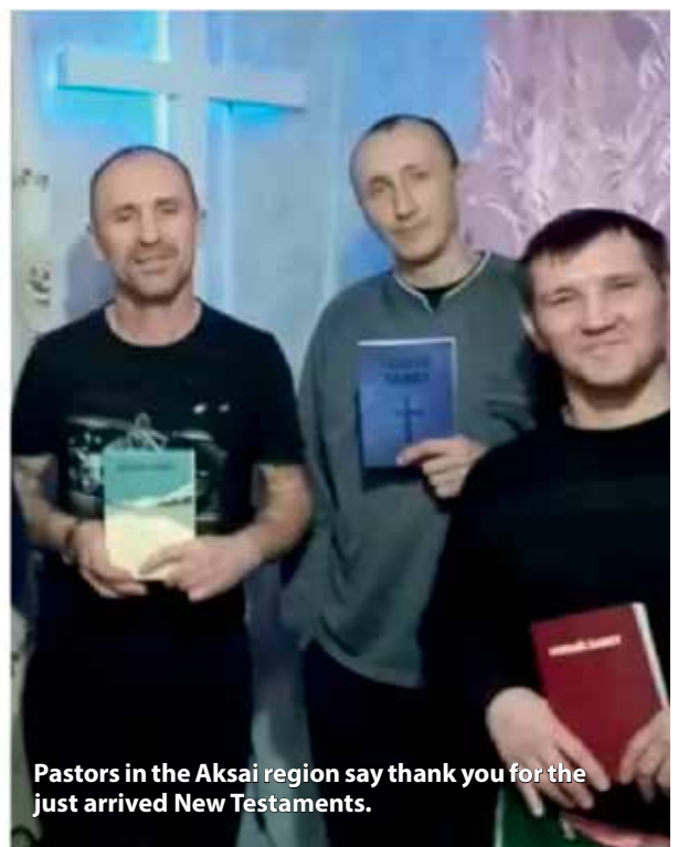
Pastors in the Aksai region say thank you for the just arrived New Testaments.