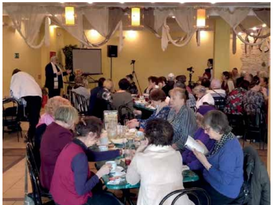
The Pesach celebration in St. Petersburg was the first event in over a year, with more attendees desiring to attend than was possible.