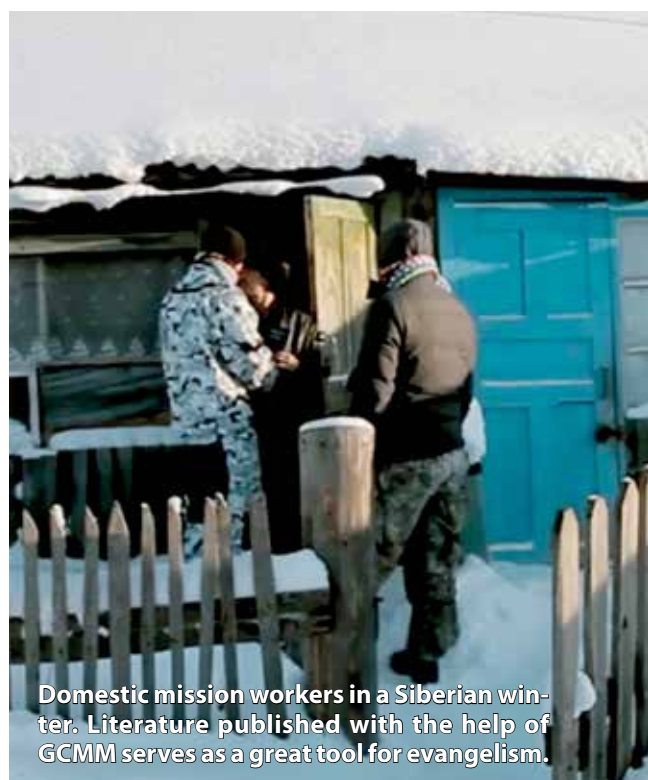
Domestic mission workers in a Siberian winter. Literature published with the help of GCM serves as a great tool for evangelism.