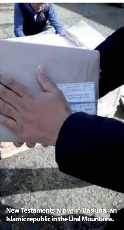
New Testaments arrive in Baskiria, an Islamic republic in the Ural Mountains.