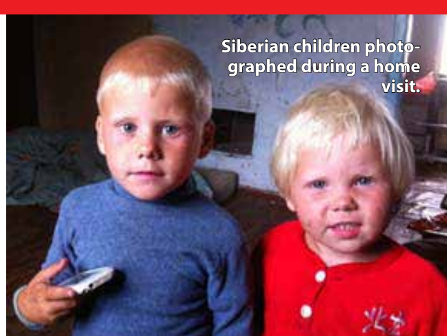
Siberian children photographed during a home visit.