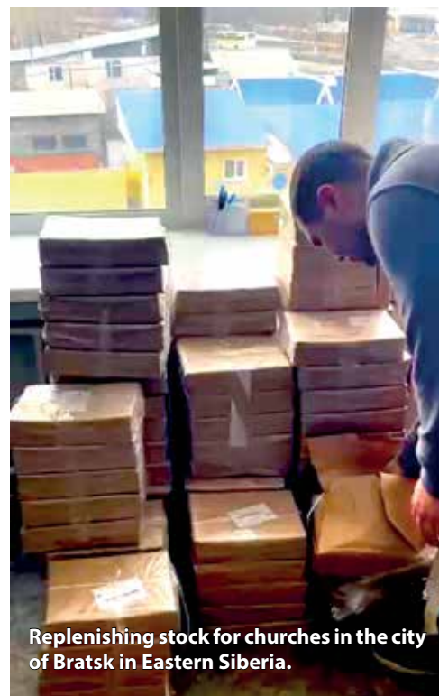
Replenishing stock for churches in the city of Bratsk in Eastern Siberia.