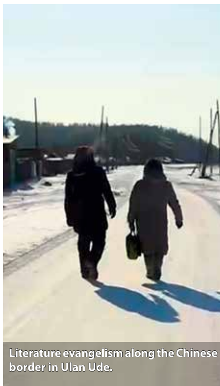
Literature evangelism along the Chinese border in Ulan Ude.