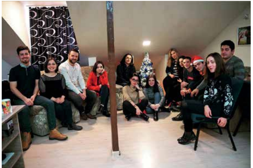
A photo at Christmas, of the Georgian TV channel team who are producing Israel themed programs into the Georgian language.

Georgia in the Caucasus, which is one of the oldest Jewish areas in the world, has a locally Christian-run TV channel. We have a program agreement with them. Their high-level production team began translating and dubbing our Israel themed programs into Georgian last year, with the first programs already reaching viewers this year.