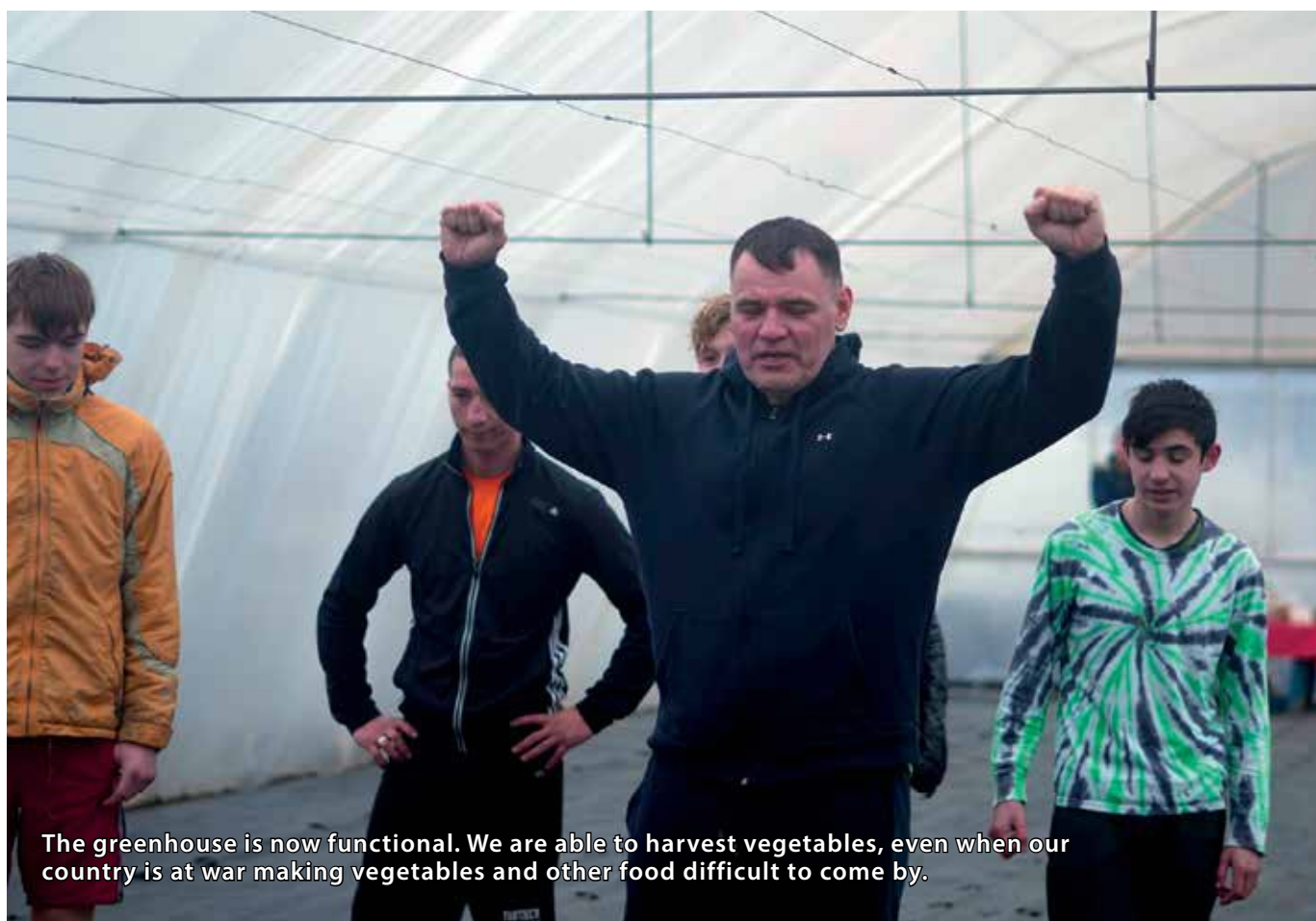
The greenhouse is now functional. We are able to harvest vegetables, even when our country is at war making vegetables and other food difficult to come by.

Yet, the children rejoice that spring had arrived. They were out playing volleyball, running and laughing.