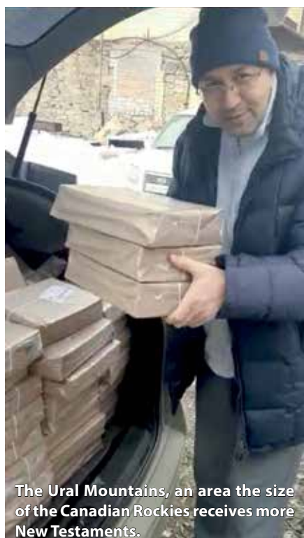
The Ural Mountains, an area the size of the Canadian Rockies receives more New Testaments.