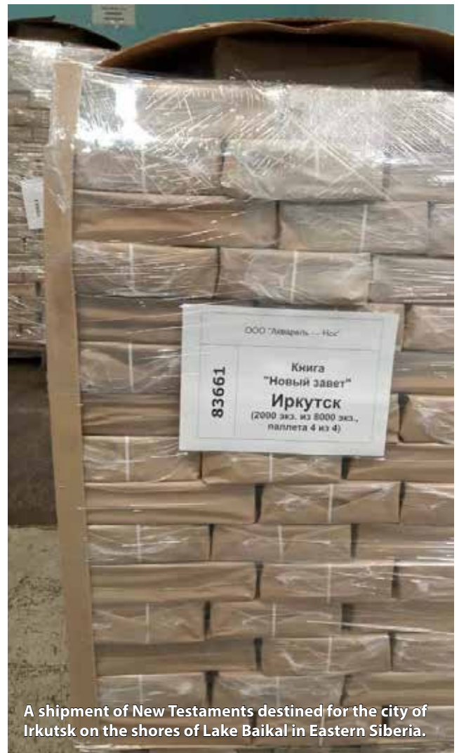
A shipment of New Testaments destined for the city of Irkutsk on the shores of Lake Baikal in Eastern Siberia.