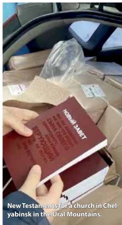
New Testaments for a church in Chel-yabinsk in the Ural Mountains.