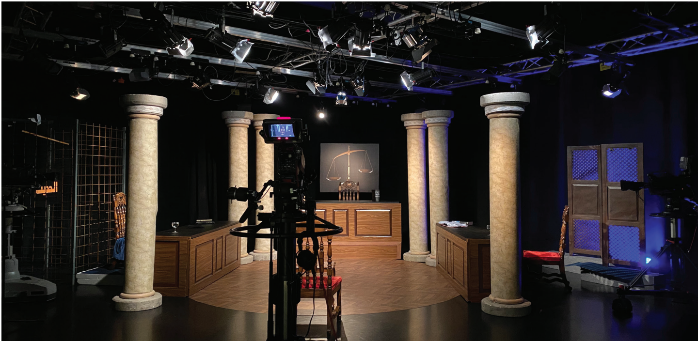
The GCM studio in Finland is set up for production of the next series of Farsi (Persian) programs.