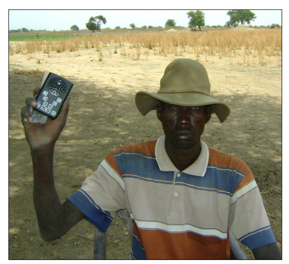
The tribe of this chief numbers 3,000 members. The chief was given a digital audio player that introduced him to Jesus.

to obtain 20,000 palm-sized audio playback units. These units are solar powered, pre-programmed, and nonerasable.