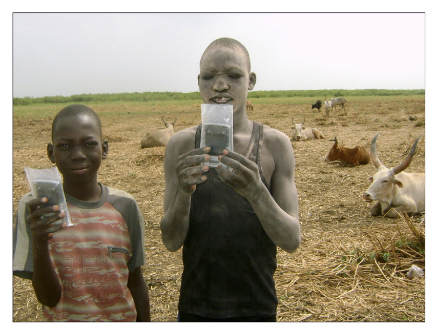
Children in villages are often recruited as soldiers. The campaign in South Sudan will minister to these children using Digital Audio Players. Photo: For these boys reading was not an option. The story of Jesus reached them via audio player.