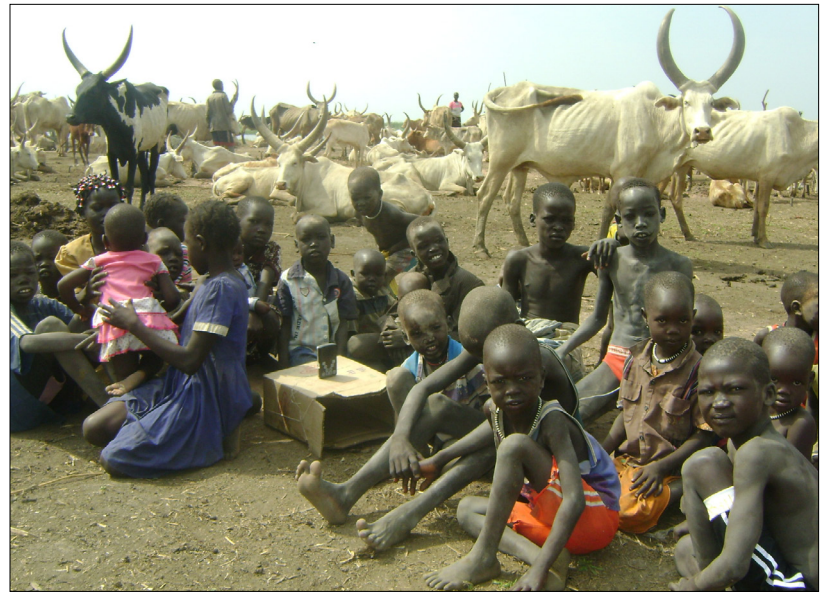
We are dealing with a nation of 12.3 million people in turmoil, riddled with extreme poverty, widespread hunger, disease, 70% illiteracy rate and tribal warfare that threatens to destroy the young nation.