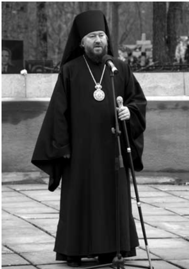
Russia's Orthodox Church has become highly politicized and can no longer answer the people's spiritual needs.