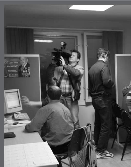
The mission call center recorded over 4,000 for spiritual guidance.