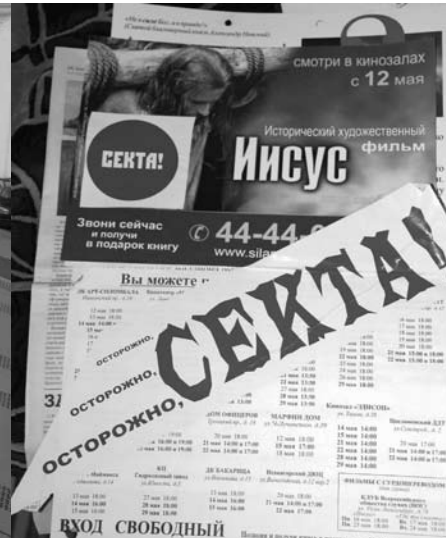
Mission Archangel experienced heavy posters with "cult" stickers and tore