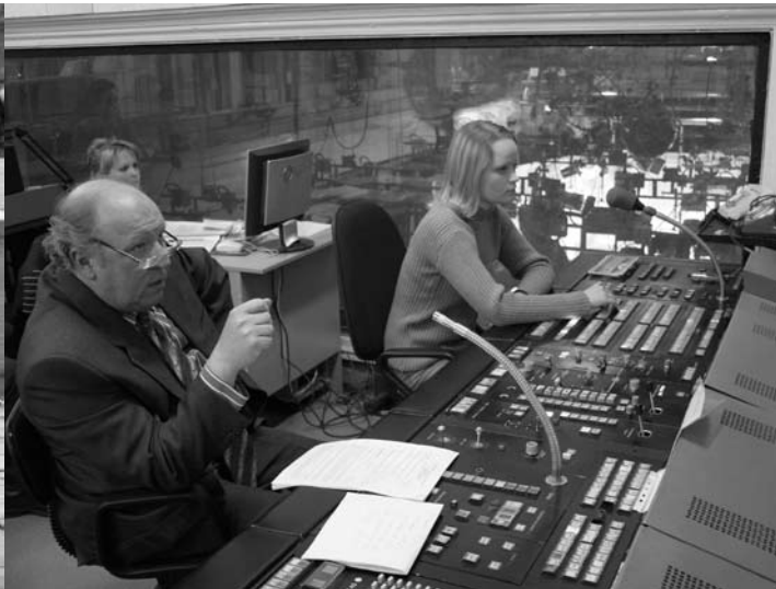
IRR/TV produced a total of 14 TV programs that were broadcast on Archangel's main television channel. There were almost 600,000 viewers