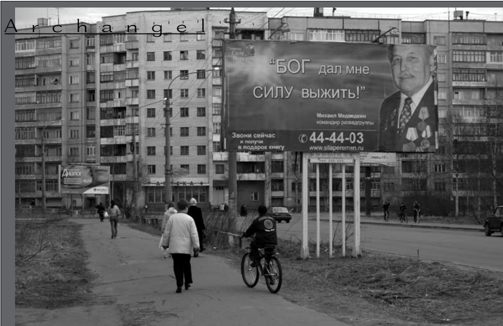
The city mission used over twenty giant billboards. The television programs also testified about God's power to free people from addictions and make their life whole again.