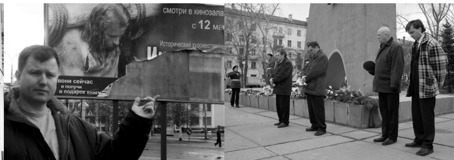
opposition by the Orthodox Church. Their officials vandalized mission up advertisements.